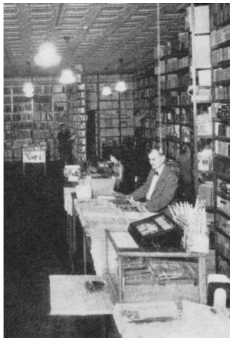
S.F. 135 Bleecker Street 1880